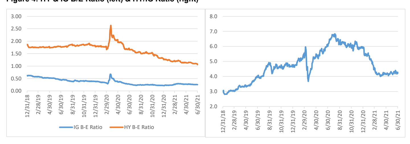
Figure 4: HY & IG B/E Ratio (left) & HY/IG Ratio (right)

Currently, the HY B/E rate is 106bp vs the IG market's 25bp (see Figure 4, left chart). While the HY rate is well below its historic median level, it is 4.2x that of the IG market (see the right chart). Furthermore, another argument for rolling down the credit spectrum within HY, should we see the short-term move to longer duration assets reverse as we expect, is the superior breakeven rates of Bs (150bp) and CCCs (272bp) compared to BBs (71bp).